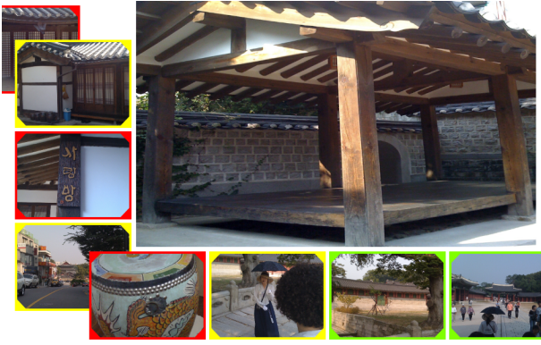
Figure 1: This Mobiphos screenshot shows the interface in mid-animation. Thumbnails are arranged along the left and bottom of the display and the viewfinder is shown in the top-right corner. Colored borders along the thumbnail indicate the user who captured the photograph.

participants relied on visual elements in the interface to a mobile text service whereas Finnish (low context) participants did not. Teng et al. examine cultural effects of technology use in the workplace [21], however there have been few studies that have examined collaborative technology use in a field setting.