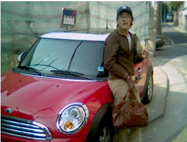
Figure 6: Photograph of participant standing in front of a car he liked. The participant requested for this pose to be captured. (Face blurred)

The subjects of the people photographs captured by our participants fell into three main sub-categories: (1) Posed Photographs, (2) Accented Photographs and (3) Blocked Photographs. Posed photographs are, as expected, an attempt to create a particular scene through group negotiation and positioning. Posed photographs occurred at the “Photo Spots” as well as with objects of interest to the participants (Figure 6). In some cases a single participant may have wanted a particular photograph of them taken and would ask the other group members to capture the photograph after getting into the pose. On some occasions this photograph was taken multiple times if the first capture was not what the subject of the photograph wanted it to be. This behavior was facilitated by the automatic sharing of Mobiphos in that the subject of the photograph did not have to leave the pose to see how they were captured but could instead view the photograph immediately on their own device and request another capture if they did not like the photograph.