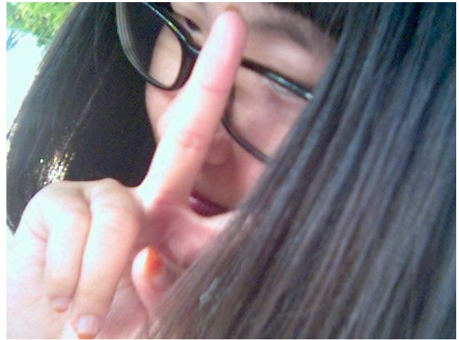
Figure 7: Female participant creating a V-shape with fingers to accent her face.

Blocked photographs were most commonly seen in situations where the photograph capturer was male and the subject, or one of the subjects, was female. Group C had the highest number of