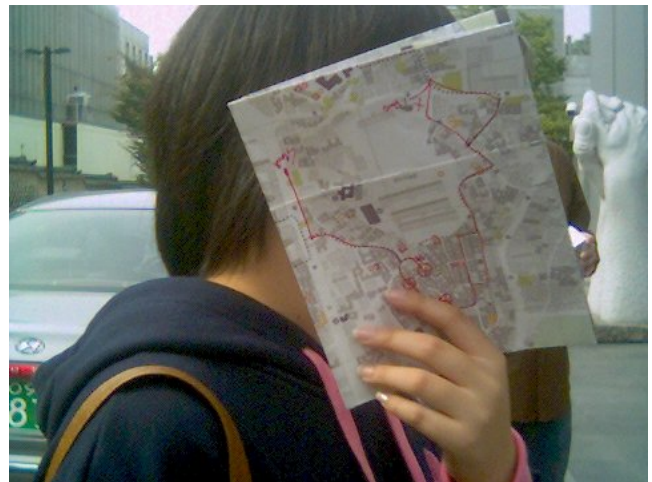
Figure 8: Female participant blocking her face with the tour map.

blocked shots. In this group, the male participants tried to capture photographs of the female participants’ faces, while the female participants attempted to block, with an item, their hands or by looking away (Figure 8). Group A, an all male group, spent the majority of their time playing a “Rock, Paper, Scissors” style game where the loser would have to approach girls on the street and get them to take a photograph with them. In all of these photographs, the girls who posed for the photograph would block much of their face. This blocking behavior is distinct from accenting behavior in that there was a strong focus on not allowing an part of the face to be captured and it lacked the same playfulness as accenting.