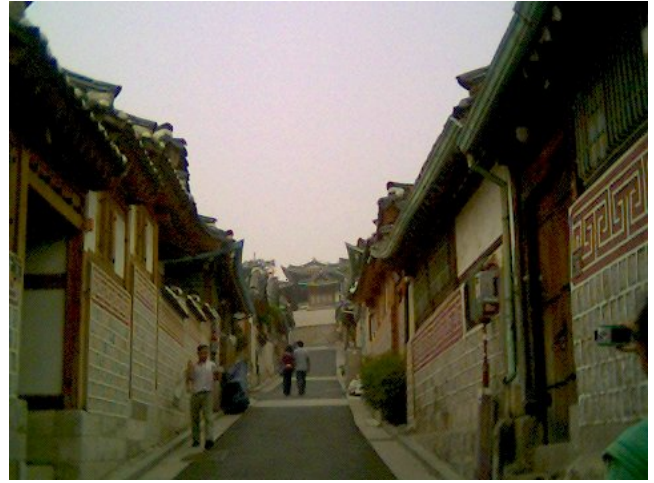
Figure 4: Photograph showing two rows of traditional architecture.

Photographs of the environment accounted for 41.04% ( SD = 19.91\% ) of the photographs captured by each group. Photographs in this category included objects of interest to participants (Figure 5) which were not part of the historical setting of the touring area. For example, many photographs were captured of non-historical buildings, flora, interesting signs and storefronts as well as objects captured to contribute to ongoing conversations. For example, in Group C, a participant captured Korean letters to spell out “Foolish