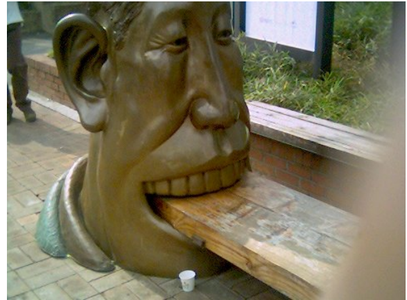
Figure 5: Photograph of a bench end. This bench was captured by multiple members of every group.

X” where “X” is the name of another participant. An outlier in this category was Group D, with 69.60% of their photographs belonging to the Environment category. Group D rarely stayed together and was continually splitting and merging to capture many different parts of the environment. This is in strong contrast to the other groups which stayed together as a cohesive unit during most of the experiment making decisions on what to capture as a group. This may have created a social filter which reduced the overall number of photos.